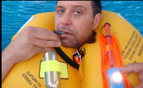
Photo showing drinking from water bladder Your chances of survival would greatly improve if you go overboard

The S.O.S Waterfront Lifejacket Vest is constructed from the highest quality materials and components with a high resistance to abrasion, UV and saltwater environments Available in a Fire Resistant Cover (optional)